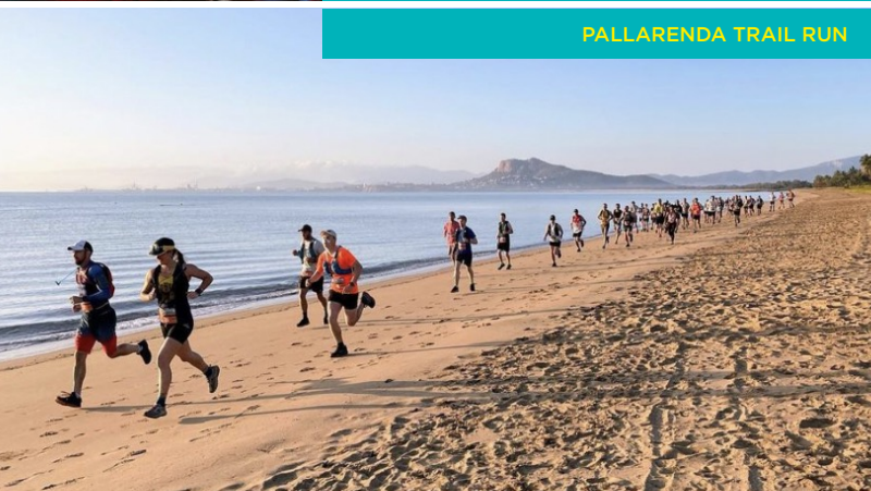
PALLARENDA TRAIL RUN