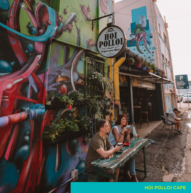
HOI POLLOI CAFE