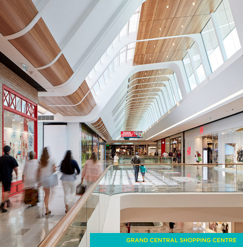
GRAND CENTRAL SHOPPING CENTRE