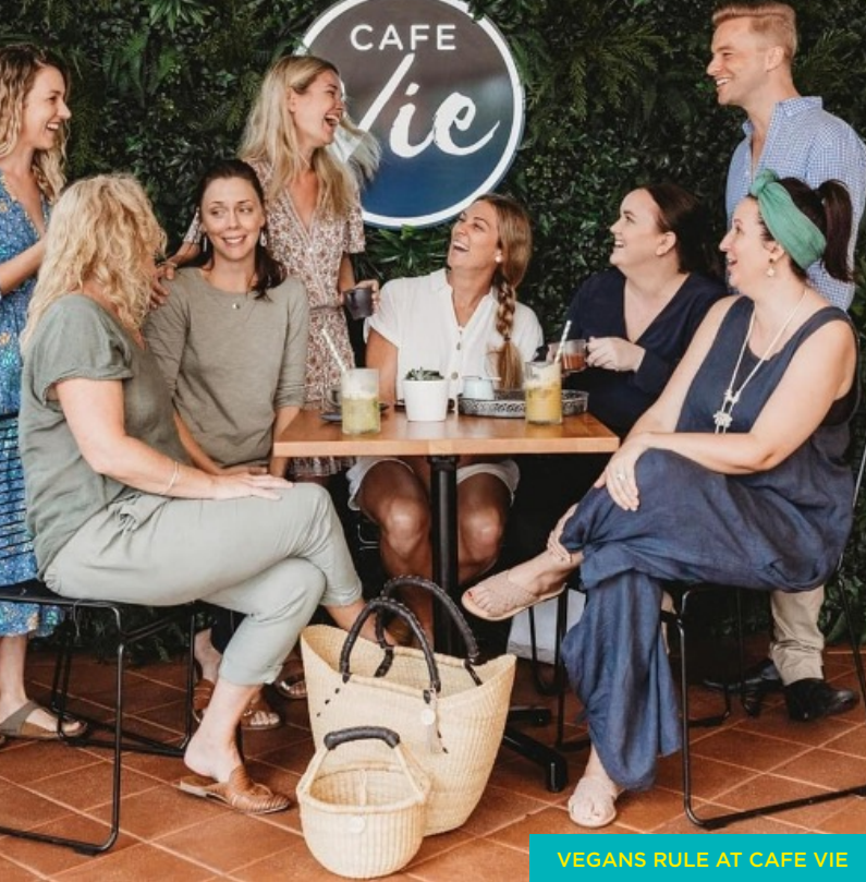
VEGANS RULE AT CAFE VIE