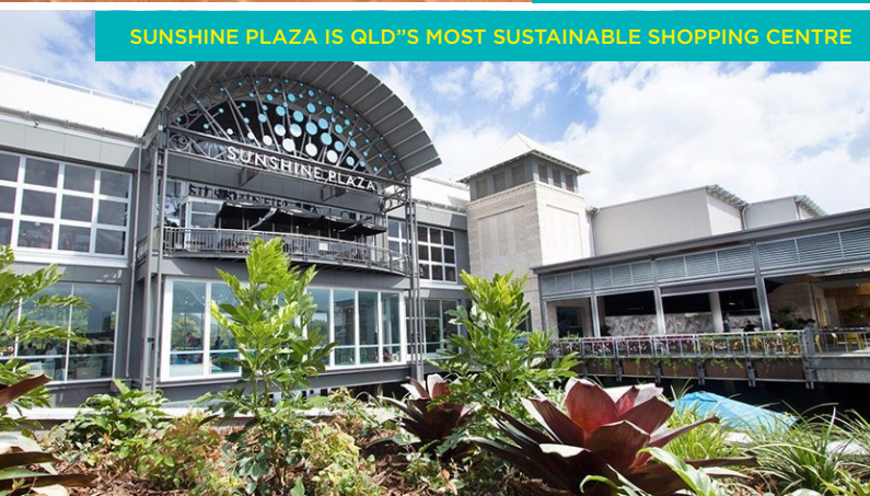
SUNSHINE PLAZA IS QLD'S MOST SUSTAINABLE SHOPPING CENTRE