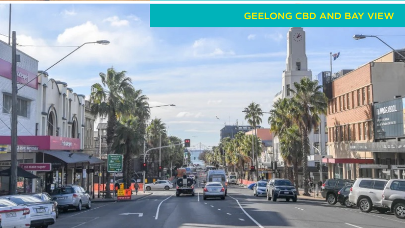
GEELONG CBD AND BAY VIEW