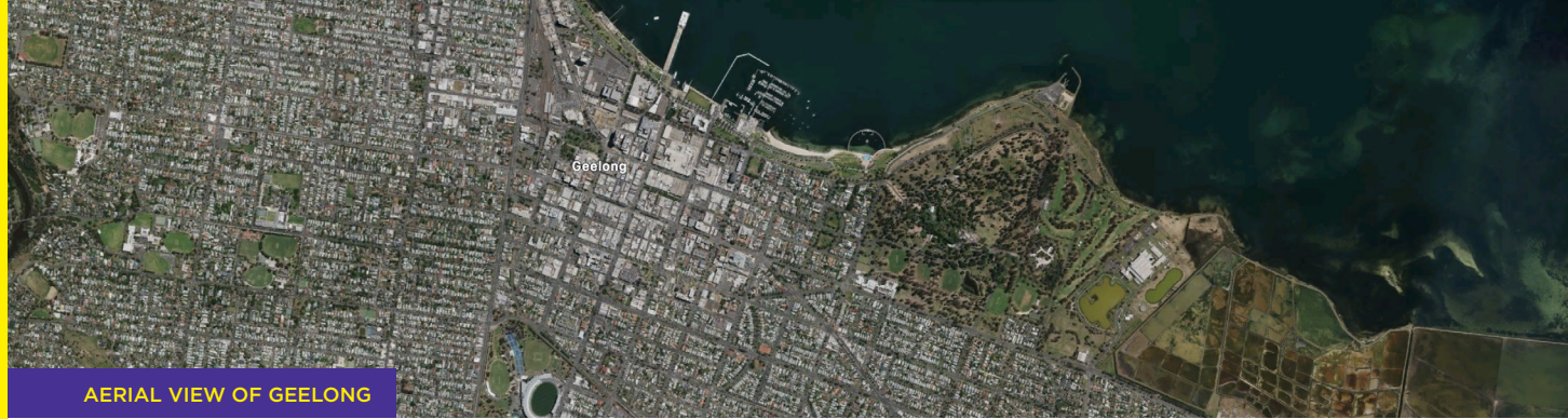
AERIAL VIEW OF GEELONG

With Great Ocean Road / Surf Coast, the Bellarine Peninsula and Melbourne at its fingertips, Geelong is a perfectly positioned Boomtown city.