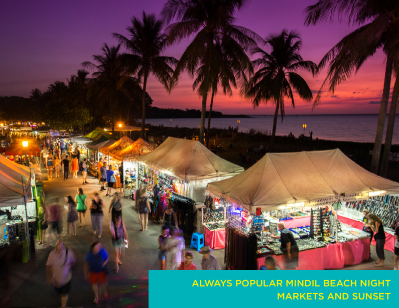
ALWAYS POPULAR MINDIL BEACH NIGHT MARKETS AND SUNSET