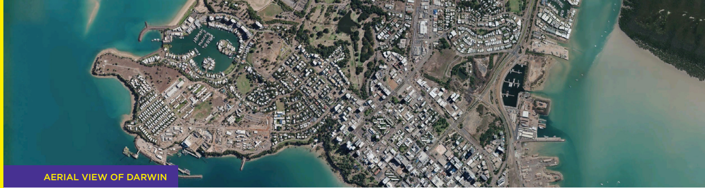
AERIAL VIEW OF DARWIN

As a recent headline read, "Darwin set for population and price growth" thanks to upcoming infrastructure projects (Hyperone High Speed Network, LNG train, and a $200 million waterpark). It's never looked better to live in the Top End.