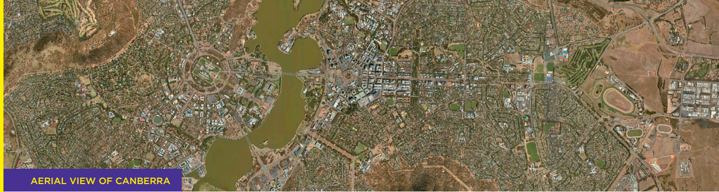
AERIAL VIEW OF CANBERRA

With some of the highest rates of recycling, bicycling and 100% renewable energy, Canberra has fast become Australia's city of sustainability.