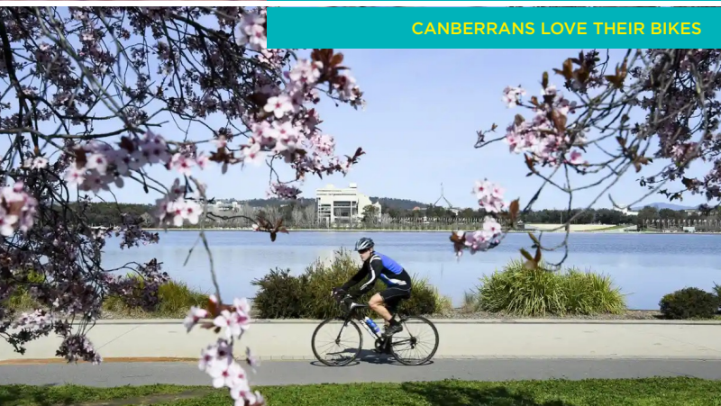
CANBERRANS LOVE THEIR BIKES