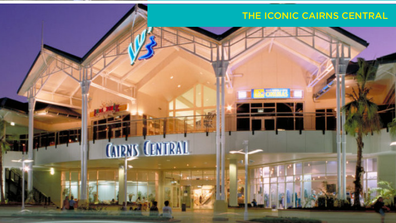
THE ICONIC CAIRNS CENTRAL