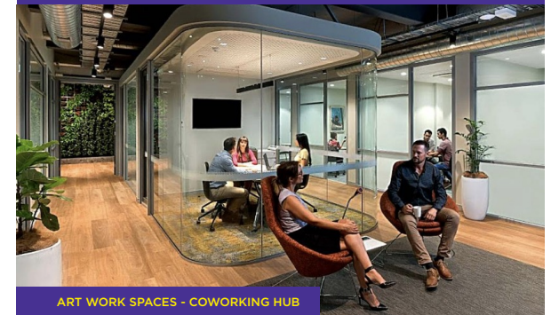
ART WORK SPACES - COWORKING HUB

Bright start-up scene: Cairns has one of the highest per capita for start-up businesses: 1 startup for every 5,300 people!