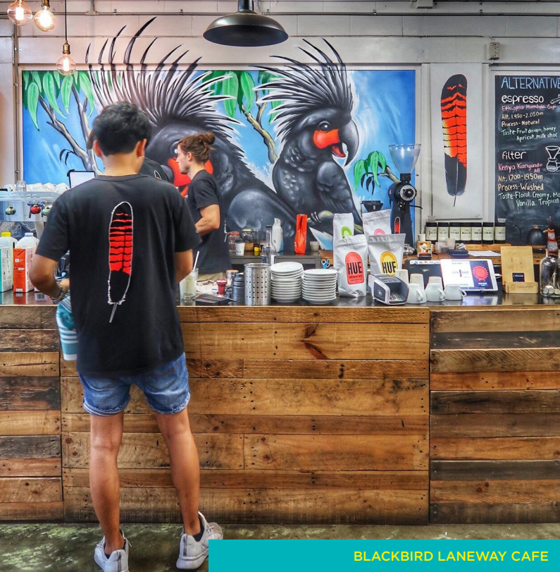
BLACKBIRD LANEWAY CAFE