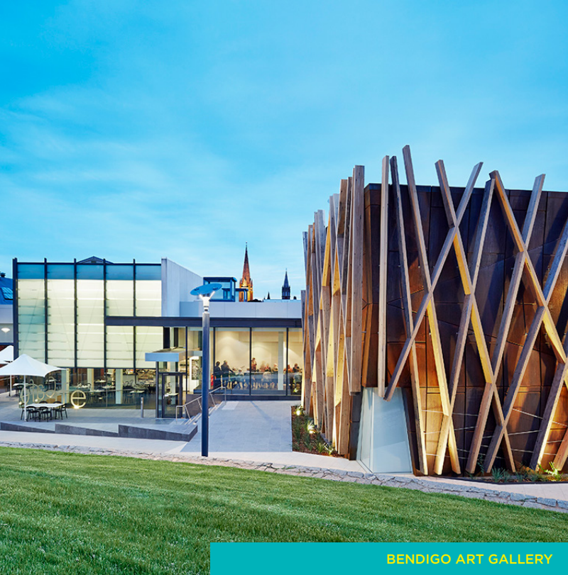
BENDIGO ART GALLERY