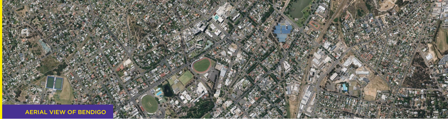
AERIAL VIEW OF BENDIGO

With regional migration and a solid growth strategy in place, Bendigo is set to become the 21st century gold rush city for Victoria.